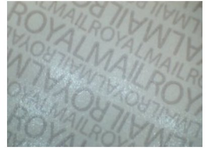
Type 3 backing paper

Type 1 backing paper printed upright only.