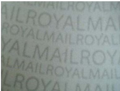
Type 1 backing paper

Type 1 = Solid line at top & bottom. Type 2 = narrow notch at top & bottom. Type 2a = wide notch at top & bottom. Type 3 = Solid line at top, notch at bottom.