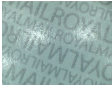
Type 2 backing paper