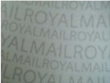
Type 1 backing paper

Order S.G. Stoneham Deegam Description Sell Walsall 1 st class security stamps with U cuts (Self-adhesive) Type 1 = Solid line at top & bottom. Type 2 = narrow notch at top & bottom. Type 2a = wide notch at top & bottom. Type 3 = Solid line at top, notch at bottom.